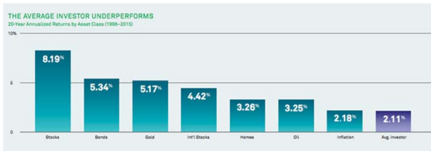
Table 1: Returns of Average Investors Relative to Other Asset Classes (1996–2015)

Rather than using short-term strategies, ordinary investors should adopt a passive, long-term, low-cost investment strategy. To maximize their long-term returns, investors should invest in low-fee index funds and mutual funds that track the broad marketplace using benchmarks like the S&P 500 and the Russell 2000 indexes. 323 Modern portfolio theory suggests that market-wide diversification along with low transaction fees would permit investors to reduce their risk exposure and maximize the benefits of compounding returns over the